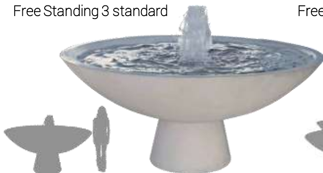
Free Standing 3 standard

Code W203st Dimensions 2000 w x 980 h Includes submersible pump pump cover disc