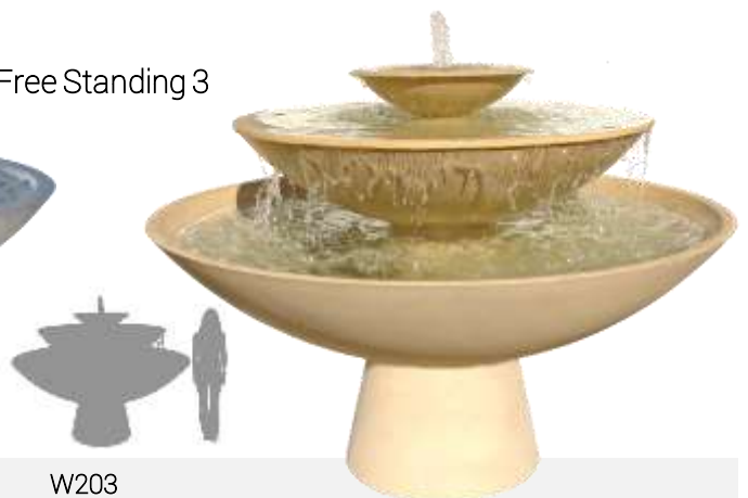
Free Standing 3

Code W203 Dimensions 2000 w x 1600 h Includes submersible pumps drainage valve