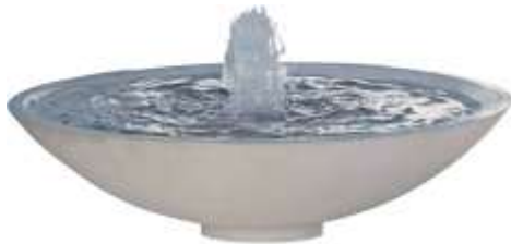
Bowl - 2000