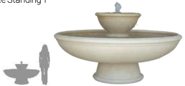
Free Standing 1

Code W201 Dimensions 1400 w x 730 h Includes submersible pump pump cover disc