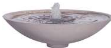
Bowl - 1400