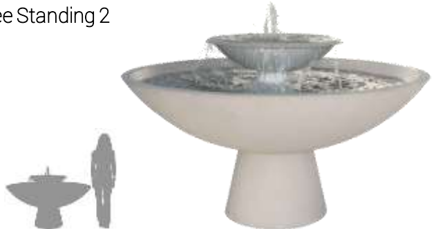
Free Standing 2

Code W202 Dimensions 1400 w x 950 h Includes submersible pump pump cover disc