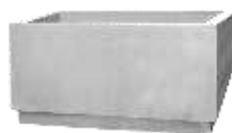
P602-1000 1000 w x 700 h