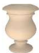
P301 785 w x 1025 h