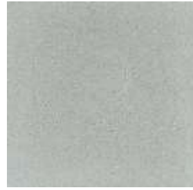
Dark Grey Sandstone