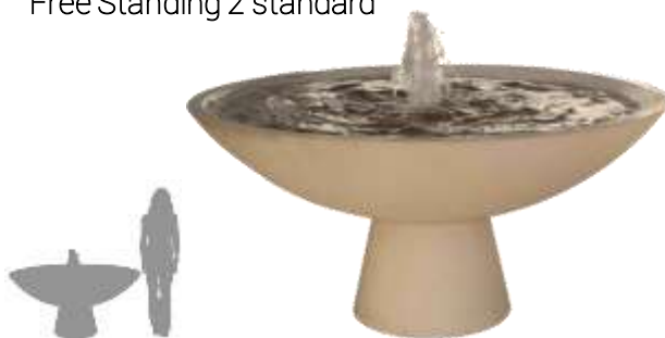
Free Standing 2 standard

Code W202st Dimensions 1400 w x 690 h Includes submersible pump pump cover disc