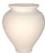
P202 790 w x 910 h