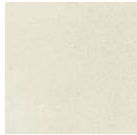
Light Natural Sandstone