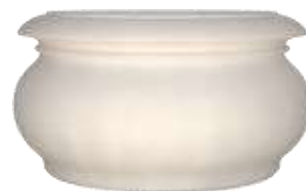
P601 2100 w x 1105 h