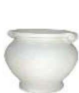
P201 670 w x 540 h

Please refer to our Classic Stone Planter Catalogue for other options.