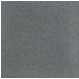
Dark Charcoal Sandstone