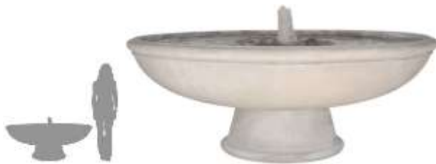
Free Standing 1 standard

Code W201st Dimensions 1400 w x 560 h Includes submersible pump pump cover disc