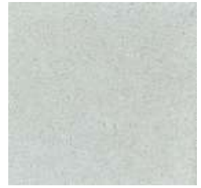
Light Grey Sandstone