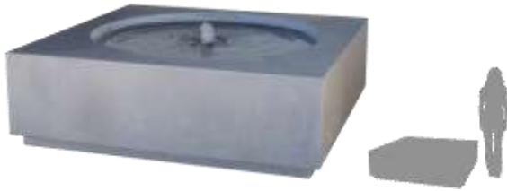
Cube - 1500